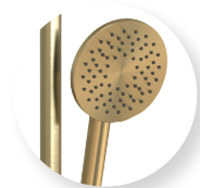
Brushed Gold TRCBGA