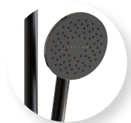
Black Gloss Black TRCMB-GBA