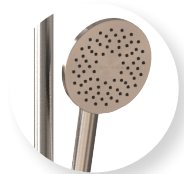
Brushed Nickel TRCBNA