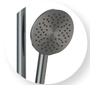
Brushed Gunmetal TRCGMA