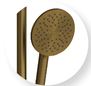
Brushed Bronze TRCBZA