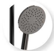
Black/Gloss Black THDRMB-GBA