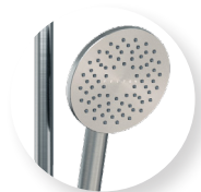
Brushed Gunmetal THDRGMA