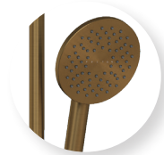
Brushed Bronze THDRBBZA