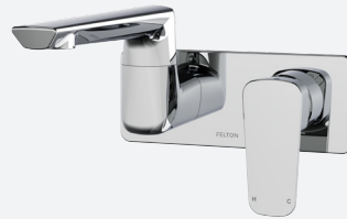
Chrome | AX2SBFCA