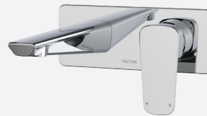
Chrome | AX2BFCA